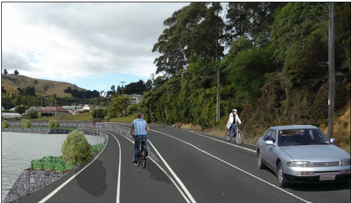
Figure 5 An artist's impression of the proposal reveals the imposition of a road-scape in Portobello that is not in keeping with the heritage and natural character of the Township. The design devalues the township as the hub of the Otago Peninsula and reduces the features that are important to the community. Greater design sensitivity and a use of the natural features are required to ensure that the character and amenity values of the area are enhanced and not reduced.

The lack of up to date aerial photography and aerial views showing both the high tide and low tide impacts of the road widening is of concern if the community is to be able to judge effectively the impacts of the project. There were few if any cross sectional drawings in the proposed plans and this was particularly pertinent to the section of proposed gabions near the store and Hatchery Road intersection.