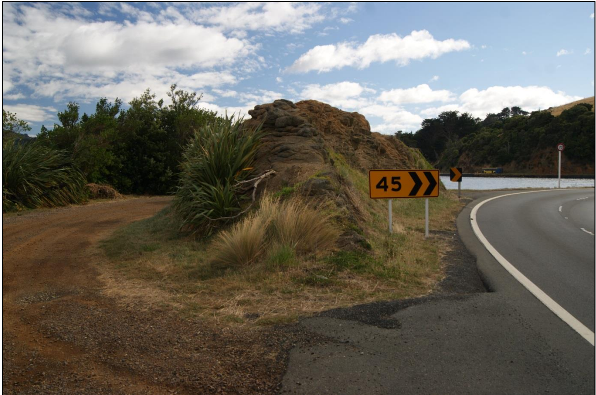
Figure 3 Landscape features of the Otago Harbour and the Peninsula are an important aspect of the natural character of the area, Portobello Community Inc. opposes the destruction of these areas in the proposed plan.