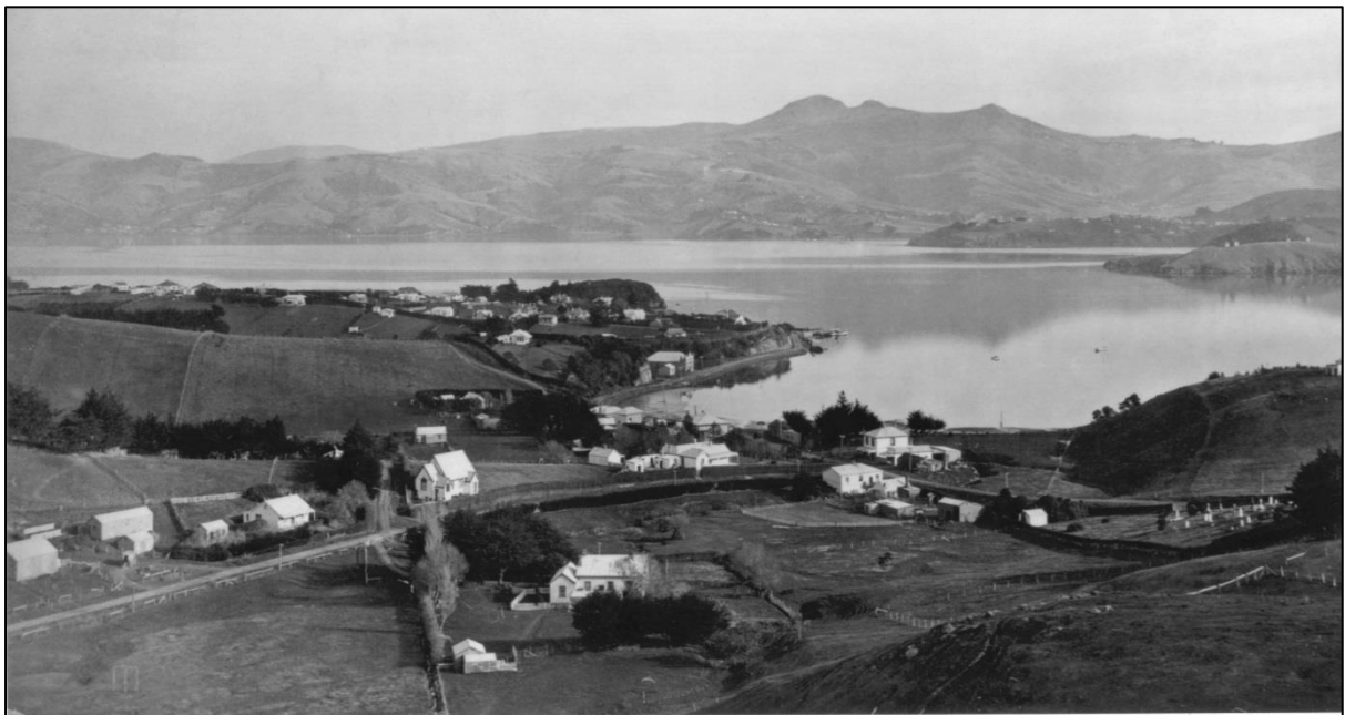
Figure 4 Portobello is a heritage town that has remained intact since its foundation in 1840. Because of that historical intactness it is an important hub for residents and visitors to the Otago Peninsula.

Portobello is unique to the Otago Peninsula because it remains the only genuine township on the Otago Peninsula. It also has a genuine cultural landscape that reflects its