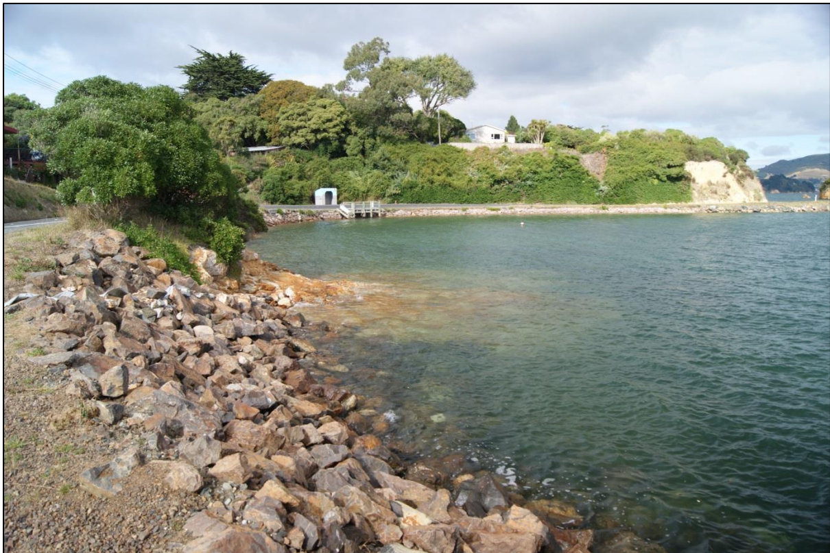
Figure 2 The beach area adjacent to the Portobello Jetty and opposite Landreth and Nicholas streets is an important recreational space for the Portobello Community and has become more important since the development of the new jetty.

The proposed landscape areas will be blasted by the prevailing winds and need to be placed in conjunction with local knowledge to ensure they will survive the tough environmental conditions. The same applies to seating placement in this area. The design has placed seats in areas of high observation, but with little understanding that the strong south-west or nor-easterly winds will make these areas unusable due their high level of exposure. Again local knowledge can pin point the more appropriate places for these types of amenities to be positioned in.