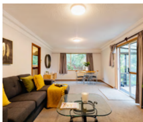
68B Ascot Street $465,000