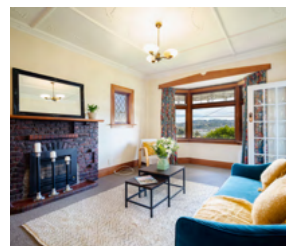
3 Highcliff Road $649,000 +