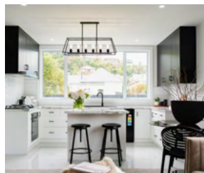
133 Musselburgh Rise By Negotiation