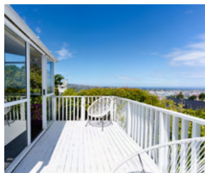
47 Russell Street By Negotiation