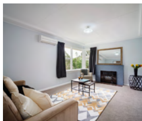
21 Winifred Street $439,000 +

So many amazing homes for sale, please contact me today for further information.