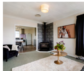
77 Greenock Street By Negotiation