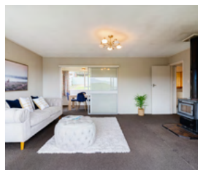
17 Orr Street $599,000 +