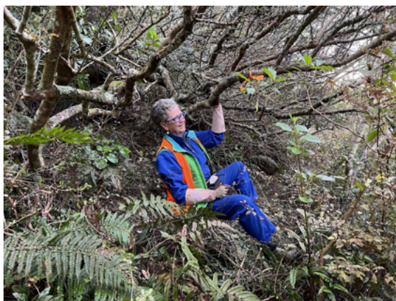
This large multi-trunked Darwin's barberry is going to need the chain saw.

barberry. With its bright orange flowers, the plant is obvious on road banks and in native bush, particularly around Pukehiki. There is no doubt the flowers are a stunning colour which is the reason for its introduction to New Zealand gardens. But Darwin's barberry originated in the forests of Chile and Argentina. The flowers produce berries which are spread by birds and so this plant is able to invade native bush and grow rapidly up to a height of 4m and live for as long as 60 years.