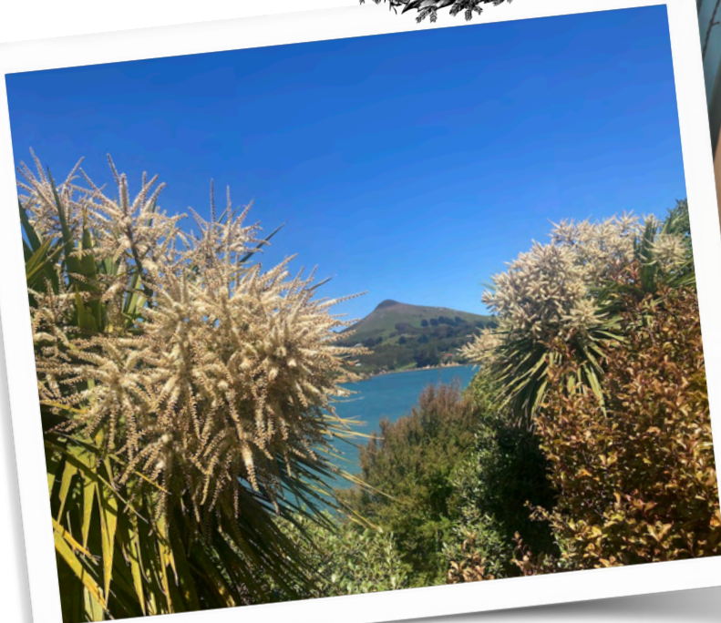
Quarantine Island Kāmau Taurua