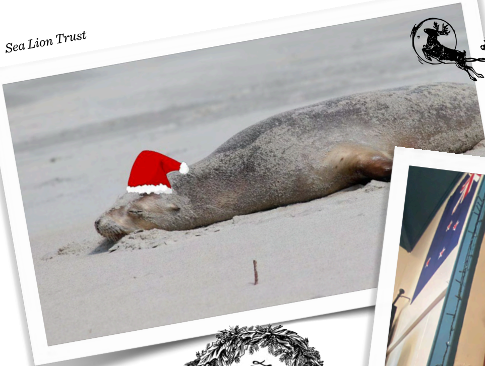
Sea Lion Trust